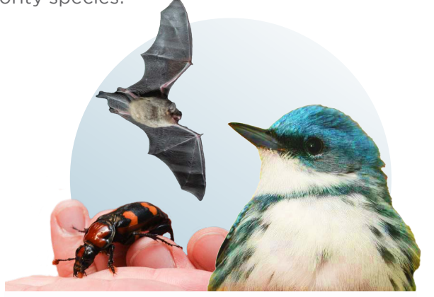
Photo Collage: Indiana Bat; American Burying Beetle: Cerulean Warbler

The Conservation Fund conducted outreach with conservation partners in the four states to identify and protect properties of high conservation value that would benefit the species' habitat impacted by the Flanagan South Pipeline. The Fund identified properties that met the mitigation objectives outlined by the USFWS.