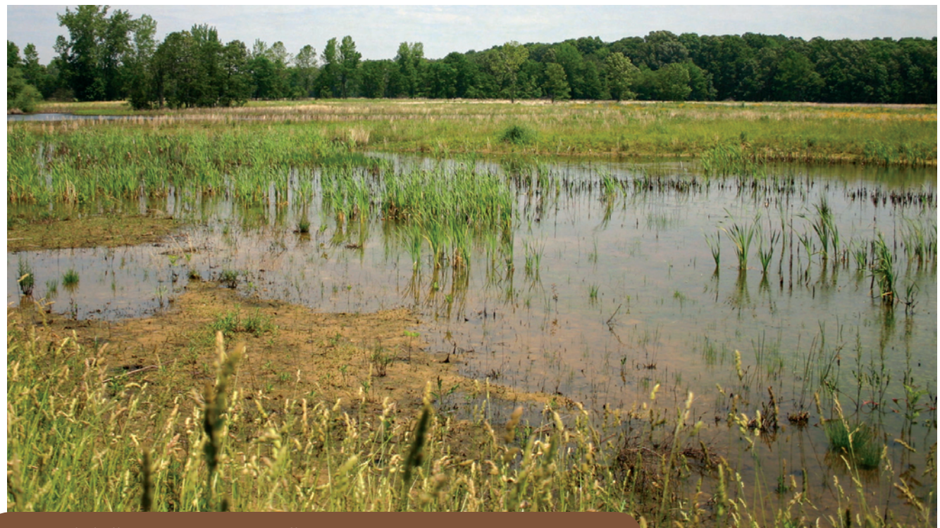
A created Shallow Water area at Duvall Farm — NRCS conservation practice CP-9.

zones. Trees were planted in the outside zone, nearest existing woods; shrubs were planted in the middle zone; and grasses were planted in the inside zone nearest the agriculture. This triple zone of filtration does a better job of trapping sediment and removing surface and subsurface nutrients. It also establishes a soft edge that is beneficial to wildlife and aesthetically appealing. In some areas where woods are not present or desired, only two zones were used shrubs and grasses.